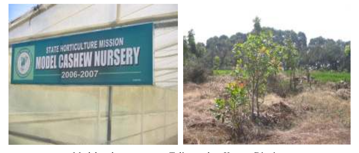
Model cashew nursery at Taliparamba, Kannur District