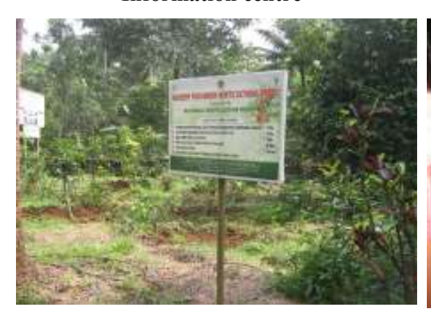
Nursery for minor horticultural crops