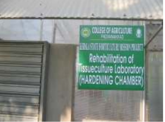
Nursery and TC activities taken up by College of Agriculture, KAU, Padannakkad