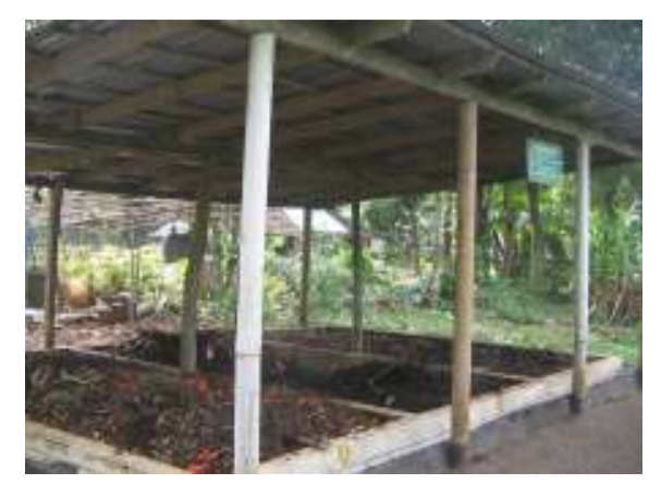
Vermi compost unit