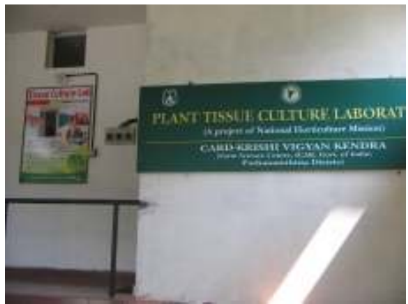
Tissue culture lab