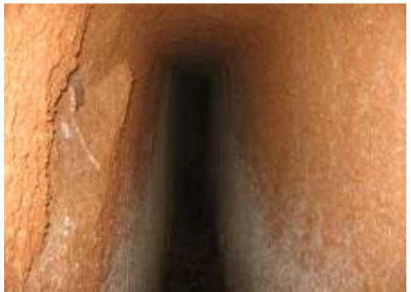
View of 'Surangam' an indigenous method of tapping spring water through tunnels