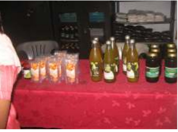
Primary processing through SHG