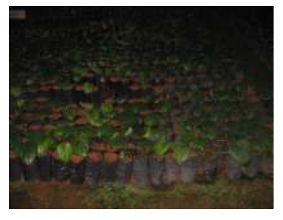
Pepper cutting raised by DASD