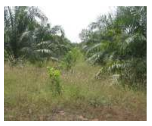
Area expansion of guava as an inter crop with oil palm taken up by Ms Mekala Savithri at Bathulapalli village.