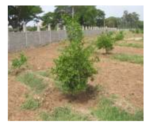
Area expansion of sweet orange taken up by Shri Kotha Sybramanayam at Vadlamudi village.