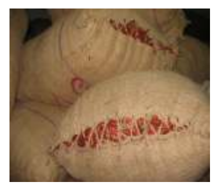
View of PSR Cold Storage set up by Shri P. Uma Shankar Rao during 2007-08 at Vadlamudi village, Chebrolu Mandal with a capacity of 5103 MT. Mostly spices like chilies and turmeric is being stored in the cold storage.