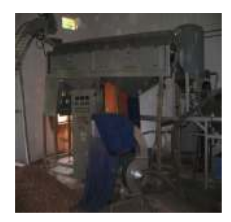
Primary processing of cashew. Raw cashew nuts are boiled, dried and then pealed. Presently, most of the raw cashew nuts is being supplied by the local farmers.